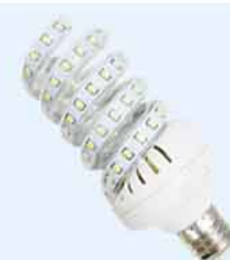
Item No.: IB015S