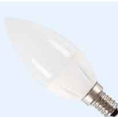
Item No.: IB017