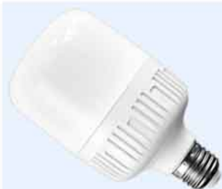
Item No.: IB008G