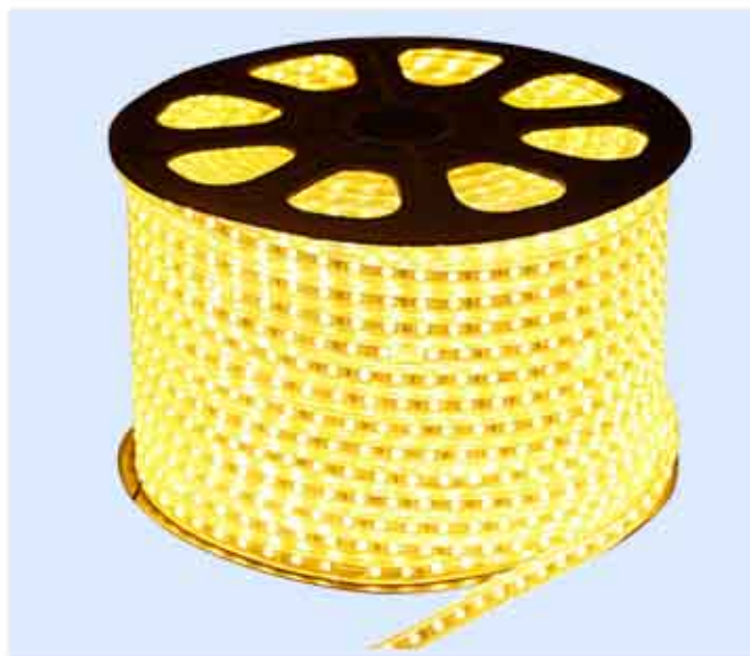
Item No.: IS001