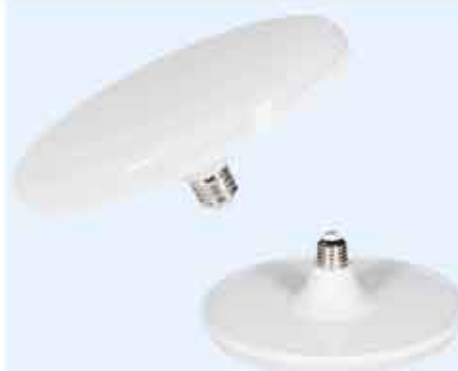
Item No.: IB009