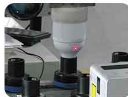
3 Laser Marking