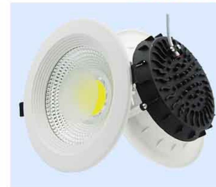
Item No.: ID003