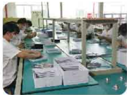
6 Product Assmbing