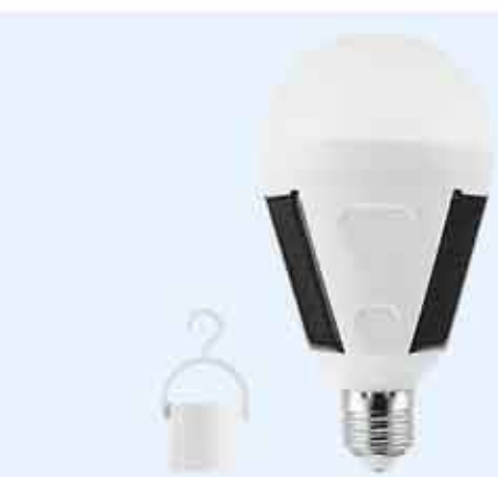
Item No.: IB024