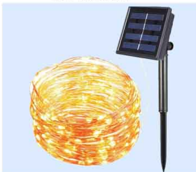
Item No.: IS005