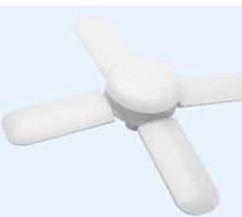
Item No.: IB031