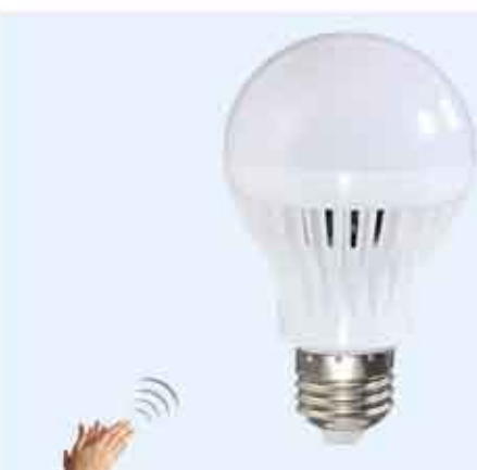
Item No.: IB023