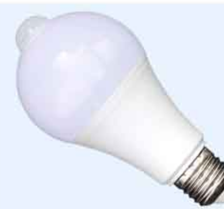
Item No.: IB004ISB