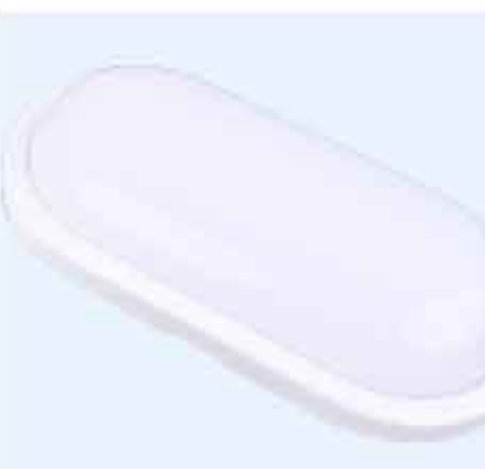
Item No.: IB027