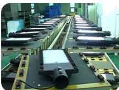
7 Product testing