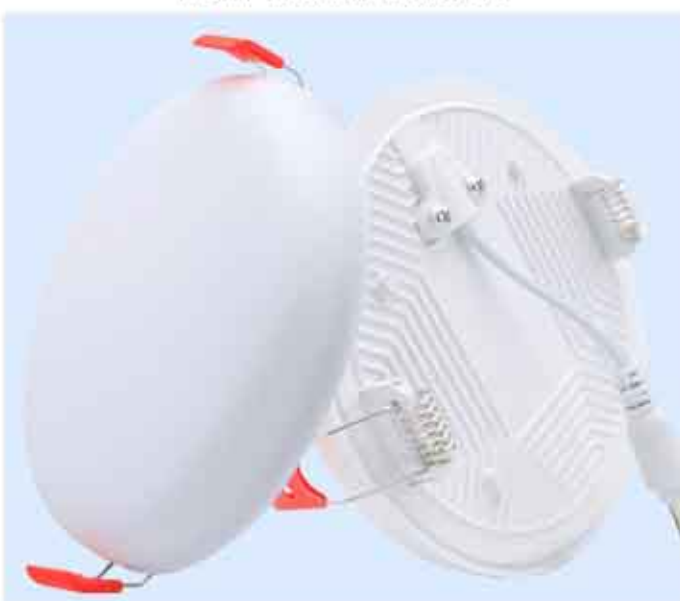
Item No.: IP011