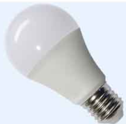
Item No.: IB001