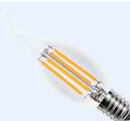
Item No.: IB018