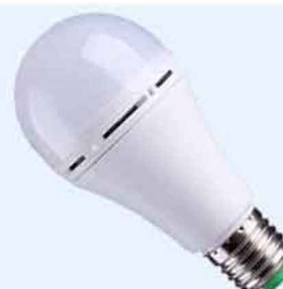
Item No.: IB007E