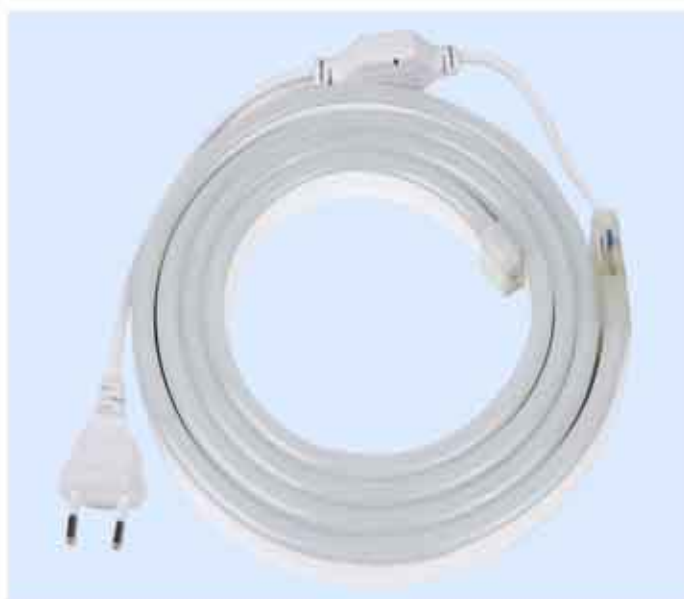
Item No.: IS003