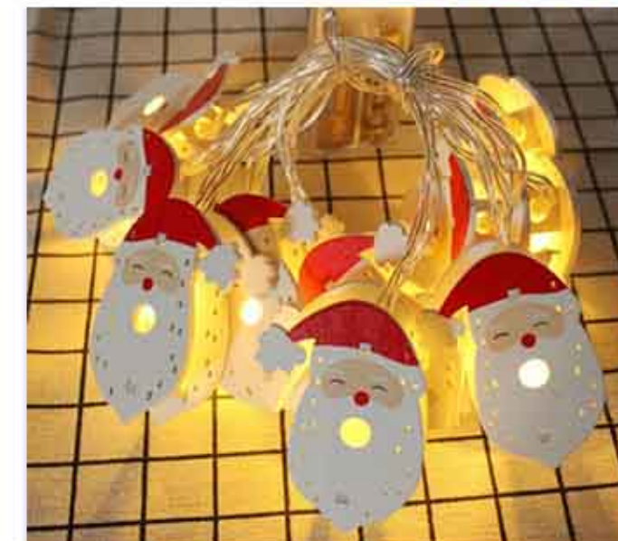
Item No.: IS007 SERIES