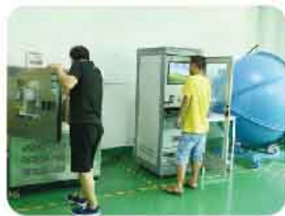
8 Test Equipment