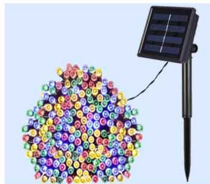
Item No.: IS004