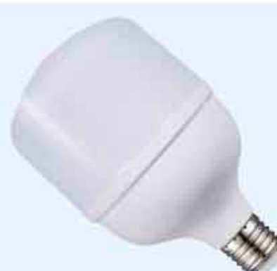
Item No.: IB008B