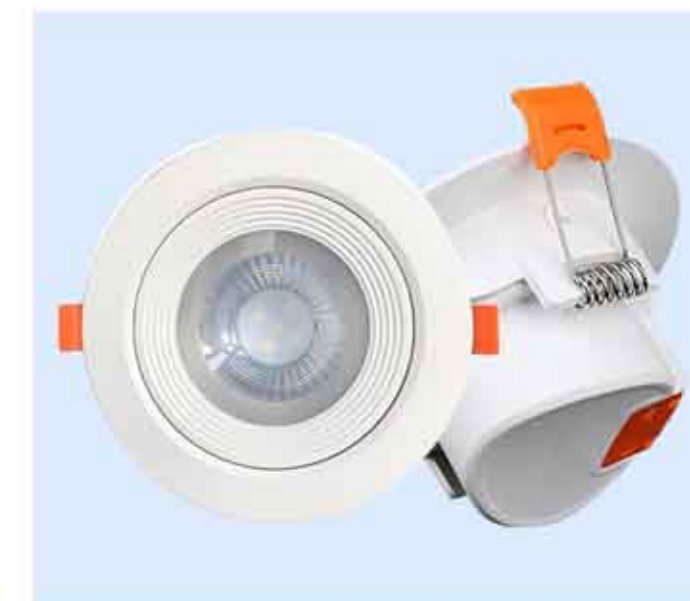
Item No.: ID007