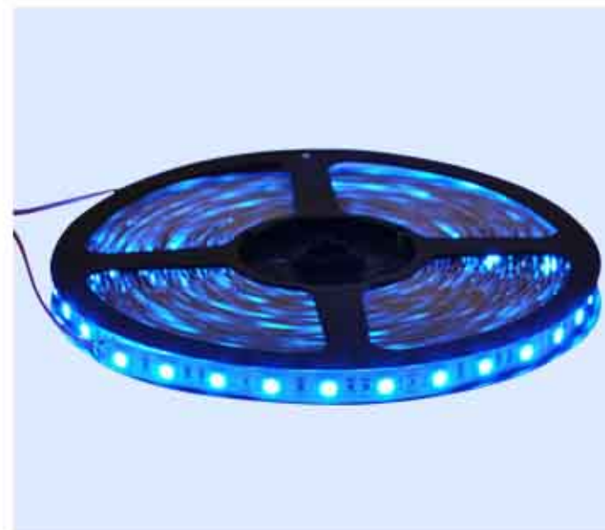
Item No.: IS002