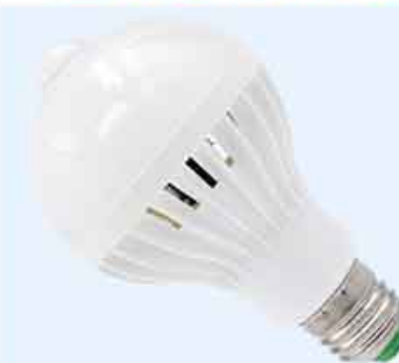
Item No.: IB003ISA