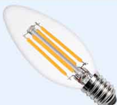
Item No.: IB019