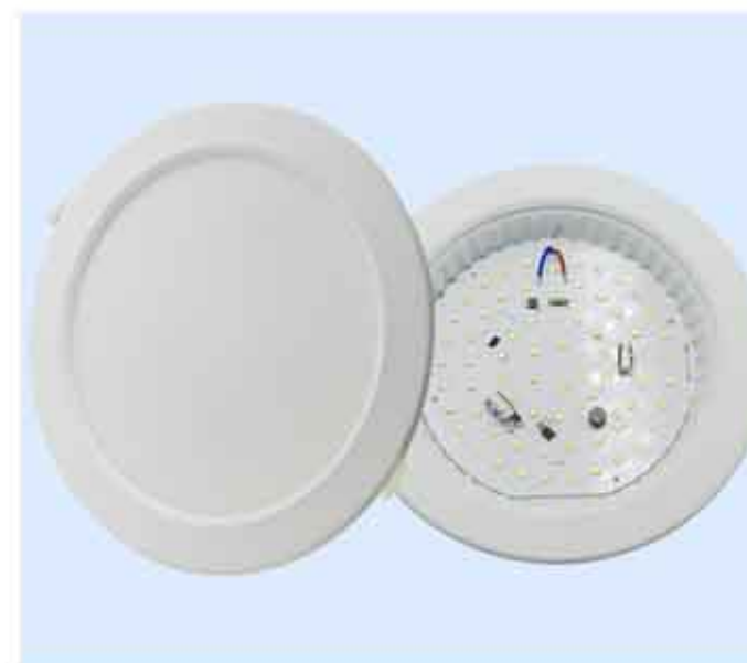
Item No.: IP006