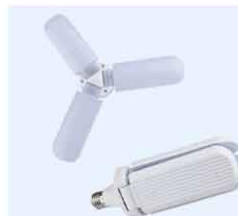
Item No.: IB029