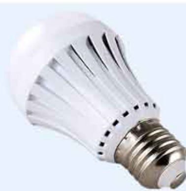
Item No.: IB002E