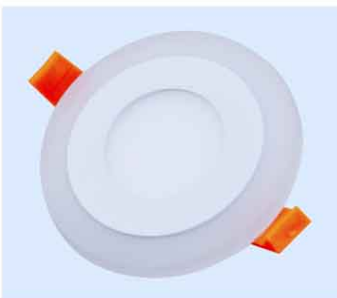
Item No.: IP002RR