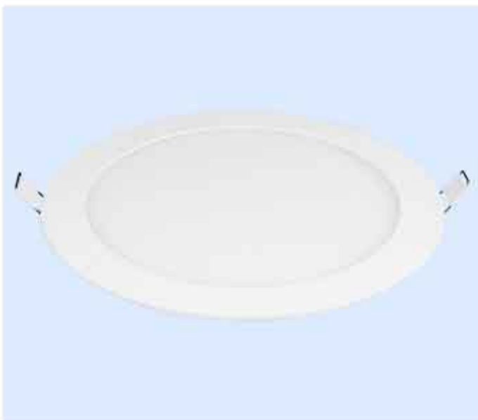
Item No.: IP001RR