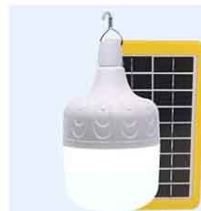
Item No.: IB025