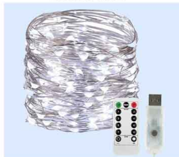
Item No.: IS006