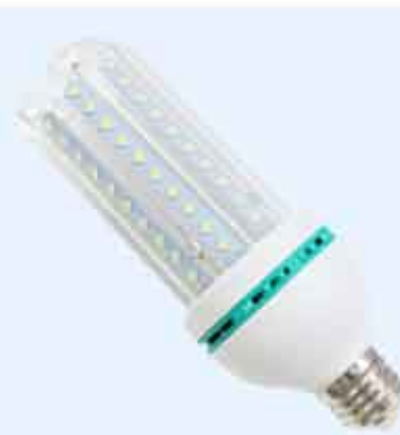
Item No.: IB015U