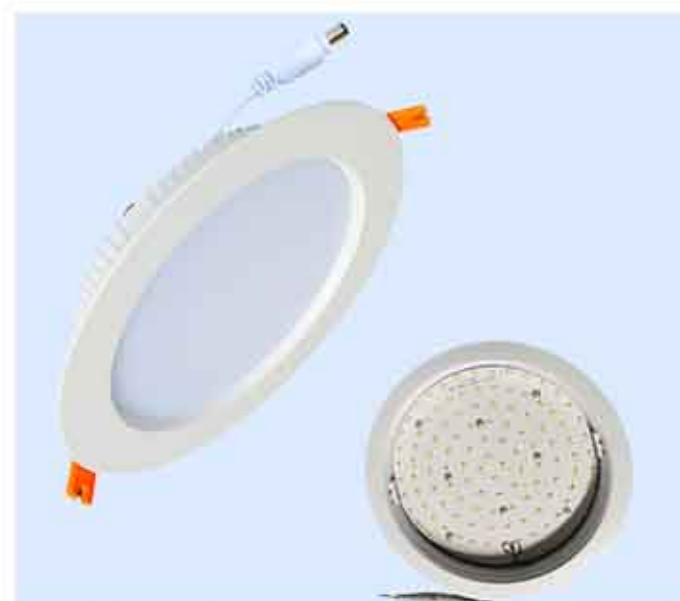
Item No.: IP010SS