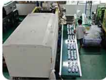
5 Driver Assembling