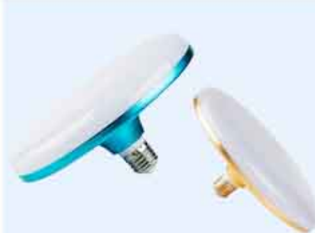
Item No.: IB009L