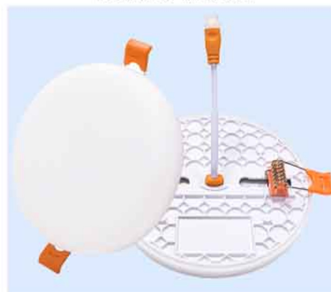
Item No.: IP014