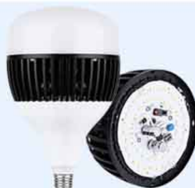
Item No.: IB026