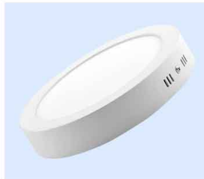
Item No.: IP001RS